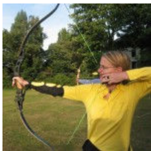
Ewa Equipment and Development Officer

The correct location of everything in both the club house and the top shed, is shown in the photographs on the following pages.