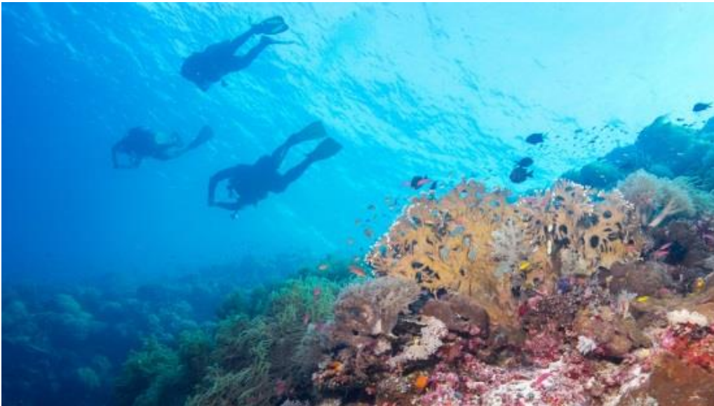
Sustainable fun in Tubbataha MPA.

In both these MPAs, fishermen can benefit when fish and their larvae swim or drift out from these restored areas into fished areas. Marine reserves in busier waters are more challenging, but recent studies indicate their effectiveness is feasible.