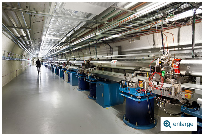
The Linac Coherent Light Source at SLAC National Accelerator Laboratory