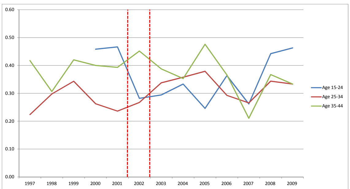
Figure 2: Percentage of All Individuals Treated For Class-A Related Diagnoses in Lambeth that are Resident in Lambeth

Notes: Figure 3 plots the share of all male individuals in the age cohort that are treated in a Lambeth hospital for Class-A drug related hospital admissions, that are residents of Lambeth. Class-A drugs include cocaine, opioids, and hallucinogens. Age cohorts are defined by age on 1st July 2001. The dashed vertical lines in each figure signify the start and end of the period when the LCWS was officially in place. The time series for the 15-24 years old cohort stops in 1999 because for earlier years there are fewer than 10 admissions in Lambeth per quarter.