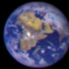
2: Earth over Plaskett crater, taken by Clementine (false colour montage).

Dave Rothery (OU) spoke about that value of experience gained from C1XS for the interpretation of X-ray data obtained by the MIXS instrument on the Bepi-Colombo mission to Mercury. A significant obstacle in the way of quantitative use of elemental abundance data from MIXS is that detected X-ray fluorescence depends on both viewing geometry and the physical properties (grain size, shape, roughness, sorting and packing) of the regolith. Laboratory experiments are underway, but C1XS data from areas of the Moon (where, unlike