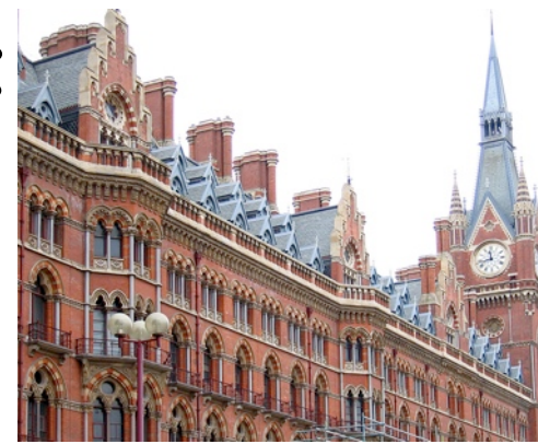
St Pancras International Arrival point for EuroStar

Kings Cross/St Pancras tube stop: Piccadiliy, Circle, Hammersmith & City and Metropolitan lines