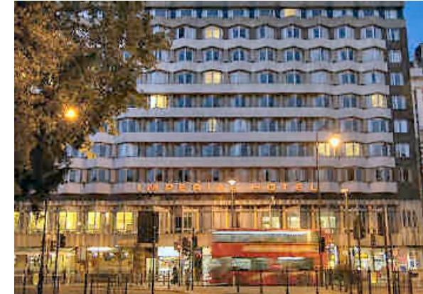
The Imperial Hotel Russell Square

Russell Square tube stop Closest tube stop to the Imperial Hotel: Piccadilly Line from Heathrow